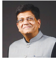
BY PIYUSH GOYAL

The Government e Marketplace (GeM) has rapidly emerged as a world leader in providing a transparent, inclusive and efficient platform for public procurement. It connects more than 1.6 lakh government buyers with 23 lakh sellers and service providers, becoming a key engine of Prime Minister Narendra Modi's vision of Viksit Bharat 2047. In nine years since PM Modi launched the transformative digital initiative, GeM has revolutionized the way government buys goods and services by weeding out corruption and giving business opportunities to startups, MSMEs, women and businesses in small town.