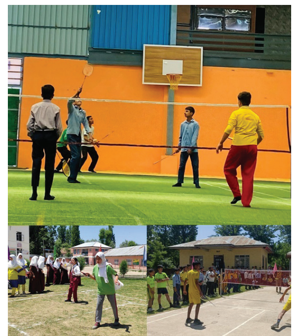
JI NEWS SERVICE BARAMULLA, MAY 15

Youth Services and Sports (YSS) Baramulla today resumed its inter-school zonal level competitions across various educational zones, marking a vibrant revival of sports activities in the district.