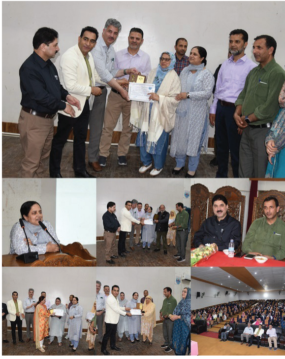
Principal GMC commended the retirees for their commitment and decades of service, stating,