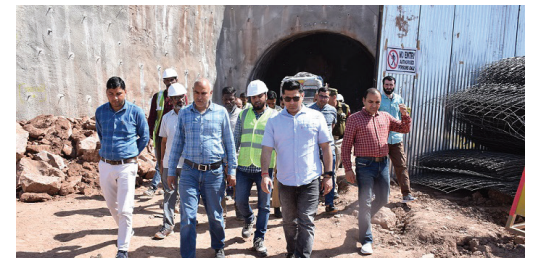
JI NEWS SERVICE