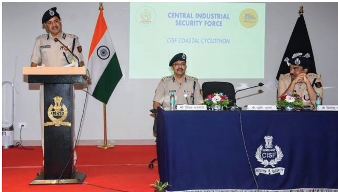
Tamil Nadu. The western route, covering 3,775 km, will commence from Lakhpat Fort in Gujarat, while the eastern route, spanning 2,778 km, will start from Bakkhali Beach in West Bengal.

and explosives. A total of 125 dedicated CISF cyclists, including 14 women, will embark on a rigorous 6,553 km journey over 25 days, covering 11 states. The expedition will commence on March 7, 2025, from two starting points: Lakhpat, Gujarat, on the western coast and Bakkhali, West Bengal, on the eastern coast. The cyclists will traverse key coastal cities, including Mumbai, Goa, Mangalore, Kochi, Haldia, Konark, Vizag, Chennai, and Pondicherry, before concluding at the Swami Vivekananda Memorial in Kanyakumari on March 31, 2025. The cyclothon will be virtually flagged off by Home Minister, Shri Amit Shah, from CISF Regional Training Centre, Thakolam, Ranipet District,