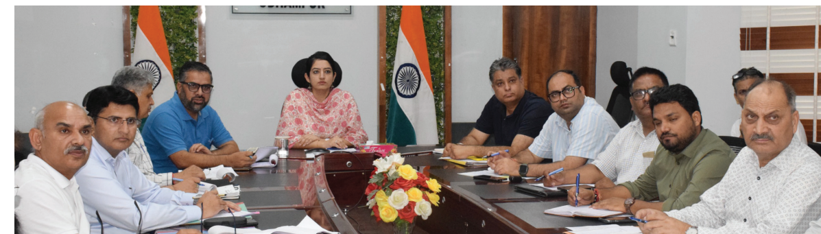
Key focus areas included Rural Connectivity, Rural Infrastructure, Public Health Engineering, Irriga-

Detailed deliberations were held on sector-wise planning at Panchayat, Block and District levels.