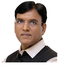
DR. MANSUKH MANDAVIYA (UNION MINISTER OF LABOUR & EMPLOYMENT AND YOUTH AFFAIRS & SPORTS)

As India marches toward its centenary of independence in 2047, employment generation and social protection have been placed at the core of our mission for Viksit Bharat. Over the past 11 years, under the leadership of Prime Minister Narendra Modi, India's workforce has been at the centre of policy, planning, and progress. This shift has led to historic improvements in employment generation and the expansion of social protection coverage.