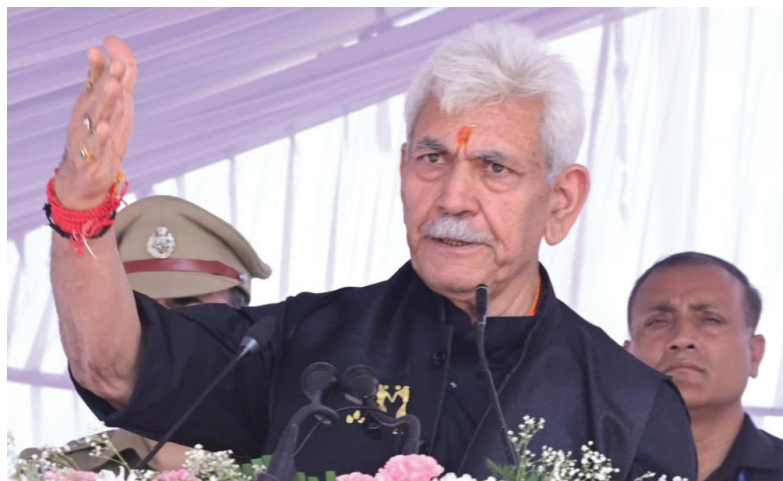
LG Sinha said, "You said, 'LG Sahab, I can give you are the police personnel. Rest – roads, water, power, agriculture – fall under the government's domain. I won't object to any development work initiated by the elected regime.'"

Responding to a set of demands from the farming community, including inclusion of horticulture under the Crop Insurance Scheme,