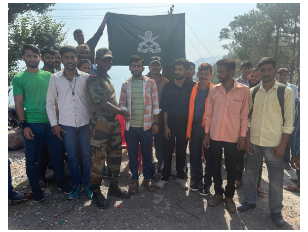
JI NEWS SERVICE RAJOURI: 14 JUN 2025

The Indian Army recently organized a "Chai pe Charcha" interactive session with the Gujjar and Bakarwal communities Mathianigala. This initiative aimed to connect with these transient populations and address their problems. The session provided a platform for the communities to discuss their challenges and concerns. The event was attended by 21 villagers from the remote village of Mathianigala, who actively participated in the discussion. The Indian Army guided the community on women empowerment, the importance of education for children, and skill development for better employment opportuni-