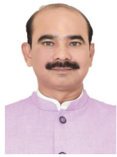
AJAY TAMTA MINISTER OF STATE ROAD TRANSPORT AND HIGHWAYS

The promise of flexibility, independence, and technological ease attracted millions of drivers to app-based ride-hailing platforms in recent years. However, rising commissions, unclear policies, arbitrary suspensions, and lack of protections turned that promise into frustration for many. These challenges, experienced by over three million gig drivers across India, highlighted the urgent need for comprehensive and enforceable regulation.