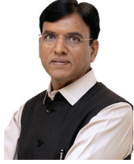
DR. MANSUKH MANDAVIYA (UNION MINISTER OF YOUTH AFFAIRS & SPORTS AND LABOUR & EMPLOYMENT)

Today, India has one of the largest youth populations in the world and it is often said that if a nation aspires to progress and become developed, its youth must be empowered. Hon'ble Prime Minister Shri Narendra Modi has consistently emphasised that if India is to become a Viksit Bharat by 2047, our Yuva Shakti must be empowered and actively engaged in the process of nation-building. Their energy, innovation, and determination will shape the country's growth story in the decades to come.