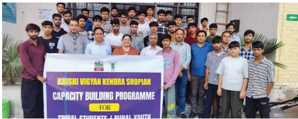
JI NEWS SERVICE SHOPIAN, JULY 14

Krishi Vigyan Kendra (KVK) Shopian today conducted a Capacity Building Programme (CBP) for 30 tribal students at Government Degree College (GDC) Shopian.