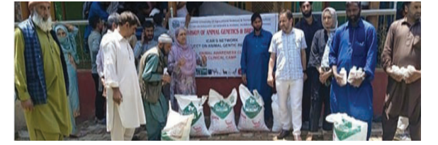
JI NEWS SERVICE SRINAGAR, JULY 14

The Division of Animal Genetics and Breeding at the Faculty of Veterinary Sciences and Animal Husbandry, SKUAST-K Shuhama, in collaboration with the department of Sheep Husbandry Srinagar, organized a clinical cum awareness camp at Faqir Gujri, Dara.