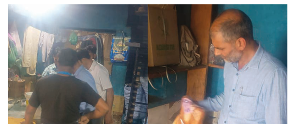
JI NEWS SERVICE ANANTNAG, JULY 14

In a decisive move to safeguard public health particularly the well-being of young children, Food Safety department Anantnag conducted extensive raids on various snack, sweet, and confectionery manufacturing units across the district.