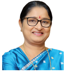
ANNAPURNA DEVI UNION MINISTER FOR WOMEN AND CHILD DEVELOPMENT

Empowerment begins with access—access to rights, to services, to protection, and to opportunity. Over the past decade, this access has been redefined and democratised through the focused commitment of the Modi Government to build a more inclusive and digitally empowered India. The Ministry of Women and Child Development has been at the forefront of this transformation. Guided by the Hon'ble Prime Minister Shri Narendra Modi's vision of Viksit Bharat @2047, the Ministry has systematically integrated technology into its programmes, ensuring that benefits reach the last mile swiftly, transparently, and efficiently.