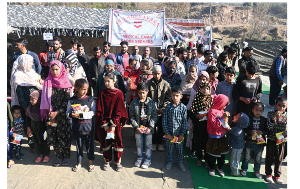
J&K NEWS SERVICE JAMMU : 20 FEB 2025

A free medical camp was organized by Indian Army under Operation Sadbhavana in coordination with Sarpanches, Block Medical Officer and Ayush medicines at Khanpur, Nagrota. A Large number of people of all age groups including old aged citizens, ladies and children were provided free medical care and specialist medical treatment by one of the best doctors of Army, civil hospital and Ayush medicines. During the camp, health of the villagers was examined and they were given health advice and medicines.