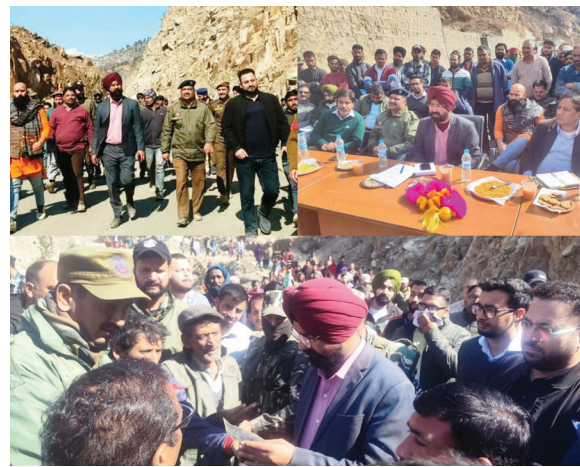
J&K NEWS SERVICE DODA, FEBRUARY 20