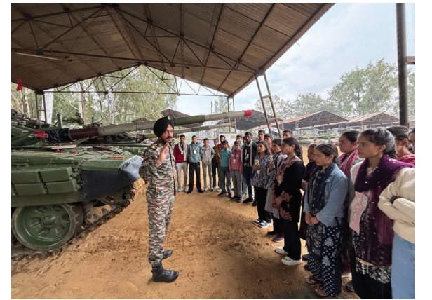
J&K NEWS SERVICE JAMMU: 20 FEB 2025

Indian Army's Gurj Division flagged off a National Integration Tour for 25 Children hailing from remote villages of Bani and Lowang in Kathua District, Jammu and Kashmir today. The Tour was kicked off with a thrilling experience of military equipment display including tank ride.