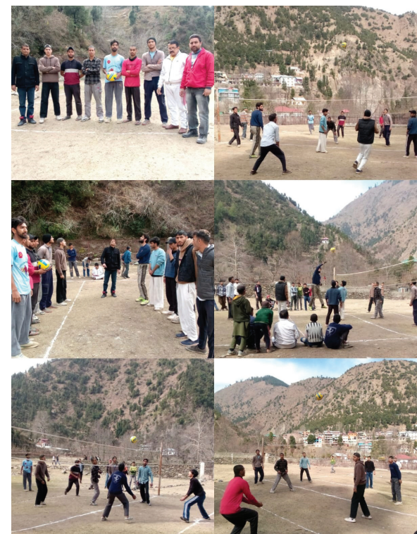
J1 NEWS SERVICE KISHTWAR, FEBRUARY 19

To encourage youth participation in sports, the Department of Youth Services & Sports organized a Volleyball Tournament at Eidgah Mughal Maidan, Zone Inderwal under the aegis of Sansad Khel Spardha 2025.