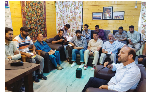
JI NEWS SERVICE SHOPIAN, JULY 3

The District Treasury Office Shopian today held first orientation session on the Single Nodal Account Samyochit Pronali Akarit Shigr Hastantaran (SNA-SPARSH) for DDOs of the district operating Centrally Sponsored Schemes.