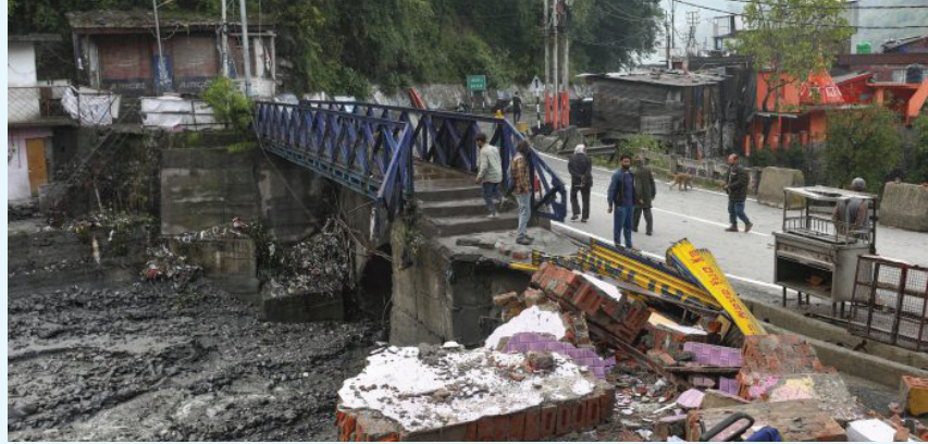
J1 NEWS SERVICE RAMBAN, APR 21 (KNO)

Flashfloods triggered by a cloudburst in Ramban have left a trail of destruction behind and have brought life to a grind-