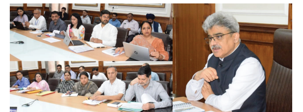
J1 NEWS SERVICE JAMMU, APRIL 21