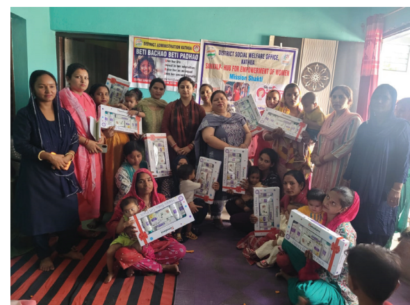
JNEWS SERVICE KATHUA, APR 18

The District Social Welfare Department today organized a meaningful awareness programme at Anganwadi Centre Goond 'B', Block Nagri, Kathua, under the Beti Bachao Beti Padhao (BBBP) initiative. The event aimed to highlight the importance of valuing the girl child and empowering women in rural areas.