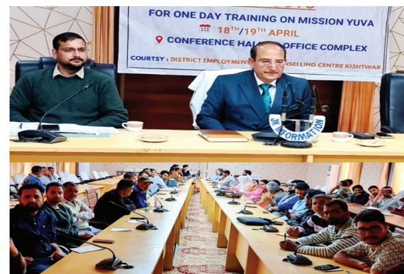
JNEWS SERVICE KISHTWAR, APRIL 18

A day-long training program for the first batch of YUVA DOOTs was today organized under Mission YUVA here in the Conference Hall of the DDC Office Complex.