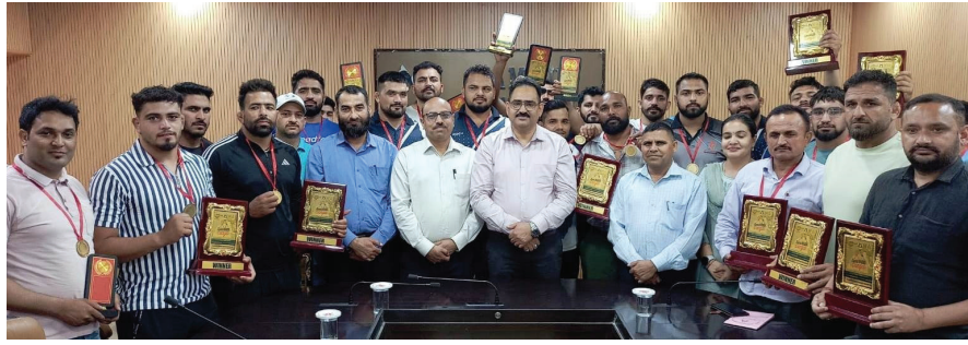
JI NEWS SERVICE JAMMU, APRIL 17

In celebration of the vibrant festival of Baisakhi, a wrestling competition was held at the scenic Suryaputri Tawi River Front.