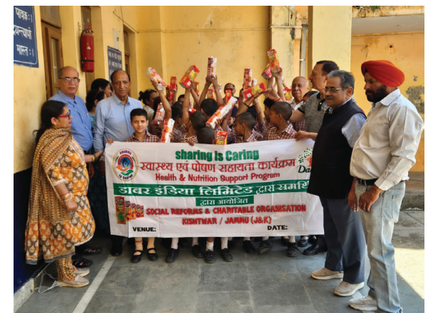
JAMMU, APRIL 17

In a heartwarming gesture of compassion and service, nutrition items were distributed among the children of Bal Niketan, an orphanage at Ved Mandir, Ambphalla. The event was organized under the Health & Nutrition Support Programme by DABUR India Limited in collaboration with Social Reforms & Charitable Organisation (SR&CO), Kishtwar.