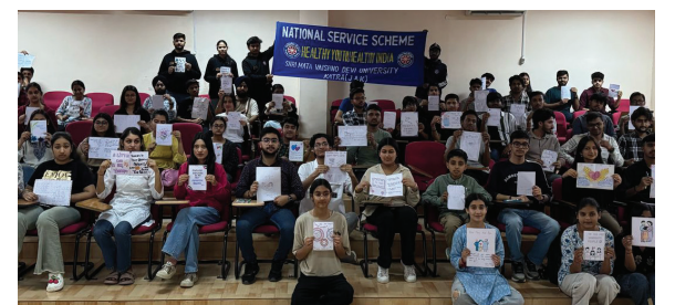
JI NEWS SERVICE JAMMU, APR 3

The National Service Scheme (NSS) successfully organized the heartfelt event 'Grateful Hearts, Loving Hands', where 80 enthusiastic participants enthusiastically participated in the event. The event aimed to recognize and honor the relentless efforts of parents by encouraging students to create personalized gratitude cards. Participants poured their emotions into beautifully crafted cards, using colors, heartfelt messages, and creative designs to express their deep appreciation. The event fostered a sense of gratitude and strengthened the bond between parents and children and their parents. Speaking about the