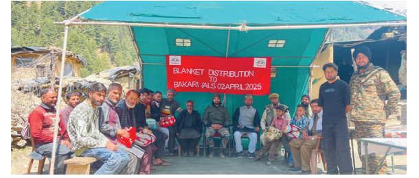
JI NEWS SERVICE POONCH: 03 APR 2025

In a heart-warming display of humanitarian efforts, a Goodwill event was conducted today in Satharban, where blankets were distributed to the Bakarwal community from the remote areas of Satharban, Rathanpathri, and Barari. This initiative exemplifies the Indian Army's unwavering commitment to the welfare of the Bakarwal community, who are often subjected to the harshest of weather conditions, especially during their migratory journey. The event was organized with the aim of providing immediate relief to the Bakarwals, ensuring they received essential winter gear to combat the extreme cold, which is particularly difficult during the migratory period. By offering these blankets, the Indian Army has not only addressed the practical needs of the community but has also reinforced its long-standing bond with the people of this region. The