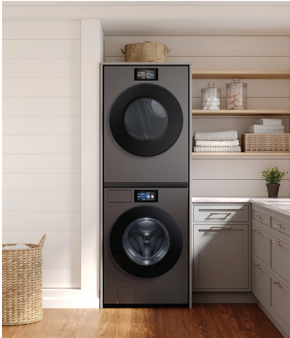
This year's Bespoke AI Laundry products incorporate the 7" AI Home screens, extending Samsung's "Screens Everywhere" vision that was first presented at CES 2025. These screens

Samsung Electronics today announced the launch of its new washers and dryer products – the Bespoke AI Laundry with AI Home – that integrate screens and Bespoke design to elevate the user experience. The Bespoke washers and dryers come in various forms of size and heating methods to meet a wide range of customer needs across diverse regions. The pair is available in both large and small capacities, making them suitable for different types of family and living arrangements. Samsung is also launching the dryer with two types of heating methods – the vent and the heat pump – to meet the needs of various environments around the world.