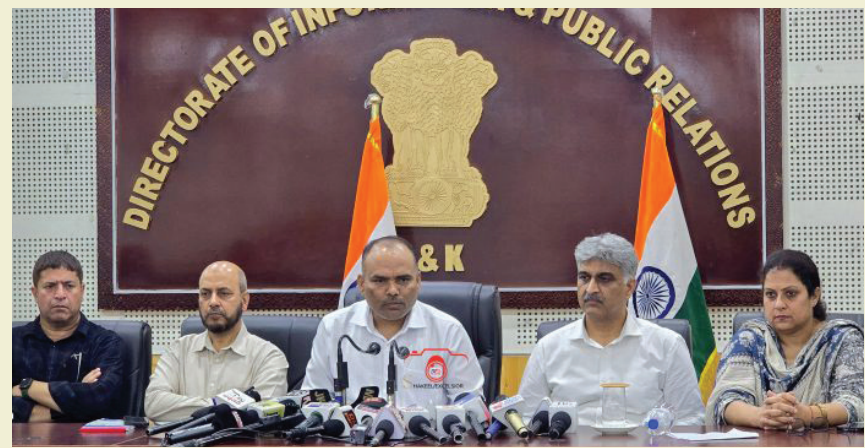
SRINAGAR, SEP 25