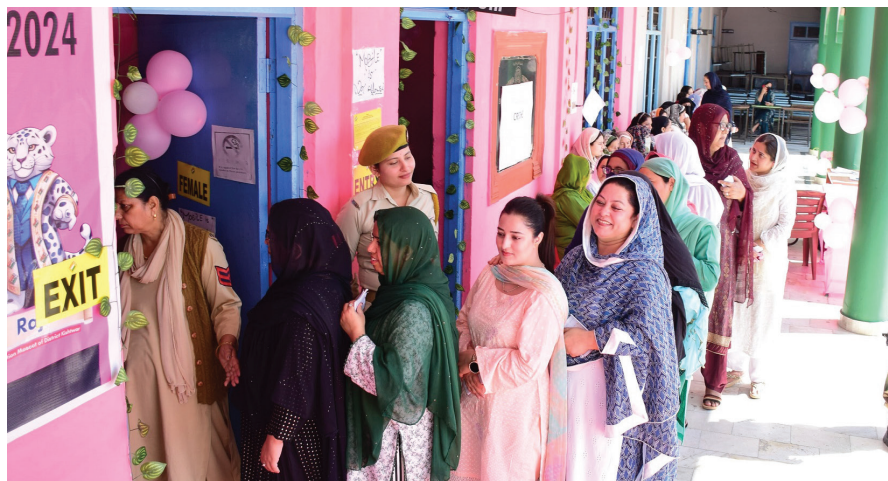
its democratic rights with a renewed sense of hope after 10 years. As per the news agency, voting took place for 24 assembly seats across

Once marred by boycotts and the looming threat of terrorism, Kashmir was seen celebrating