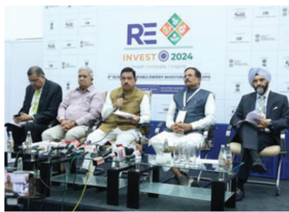
The CEOs provided inputs for ramping up the manufacturing, creating demand with effective

"Therefore, the CEOs must share what the facilitation required from the government."