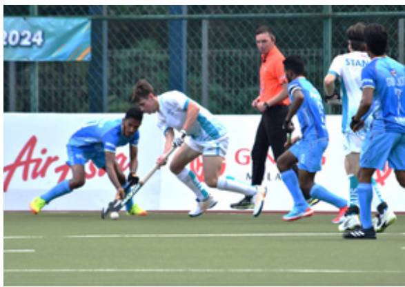
Table toppers India faced a stiff challenge from

the get-go. Though India made a promising start, Australia resorted to high-press early in the game to control the ball possession. The Australians used speed to their advantage and set the momentum they needed to create shots on goal.