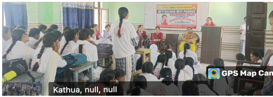
Kathua, null, null