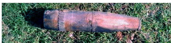
J I NEWS SERVICE JAMMU, OCT 7

The security forces on Monday recovered a suspected Improvised Explosive Device (IED), a rusted anti-tank mine and a mortar shell in Rajouri and Samba districts of Jammu and Kashmir.