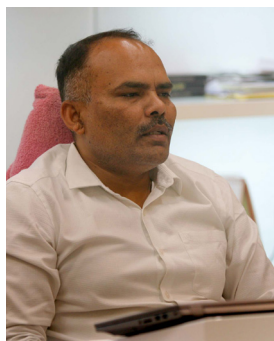
J I NEWS SERVICE SRINAGAR, OCT 7

Finally, the wait is over for the election results that would be declared tomorrow for 90 seats of J&K Assembly. Counting will begin at 25 locations across the UT amid multi-layered security cover even as candidates maintain the night long wait will be filled with a little bit of fear and an increase in the heart rate.