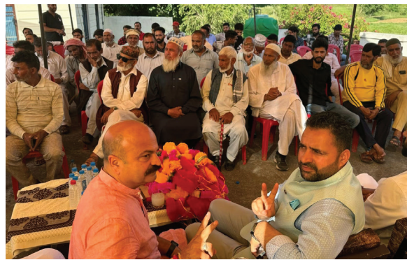
Saubhagya Scheme, Pradhan Mantri Kisan Samman Nidhi, etc.