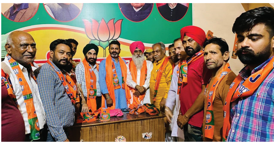
JI NEWS SERVICE JAMMU, MAY 19