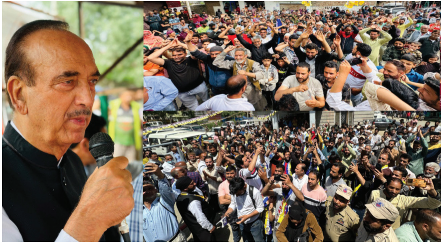
JI NEWS SERVICE ANANTNAG, MAY 19

Chairman of the Democratic Progressive Azad Party (DPAP), Ghulam Nabi Azad, today criticized regional parties for neglecting crucial public issues in their election campaigns. During a series of roadshows in Bijbehra Anantnag, Azad expressed his discontent with the current political discourse, stating that these parties claim the election is not about fundamental issues like water and electricity. "Why are these parties contesting elections if they are not addressing the real problems faced by the people?" Azad questioned. "Are they here to exploit the innocent people once again?" He highlighted the pressing concerns that affect everyday life, noting a significant rise in electricity bills, lack of water facilities in rural areas, increasing unemployment, and the growing problem of drug abuse among youth. He emphasized that young people are forced to compete with outsiders for jobs, further exacerbating their struggles. "Why are these