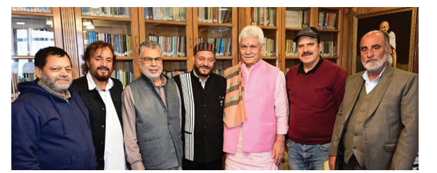
Representatives of J&K Music Artists Federation Srinagar called on Lieutenant Governor Shri Manoj Sinha at Raj Bhawan. Subsequently, a delegation of residents of Khimber village, Srinagar also met the Lt Governor at Raj Bhawan.

Later, the observer visited migrant habitations at Garhi and Jakheni and interacted with the migrant electors and enquired from them about various facilities being provided by the ECI.