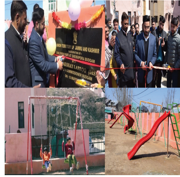
CPO, Executive Engineers and other concerned officers of R&B, Tehsildar, DMO and officials.