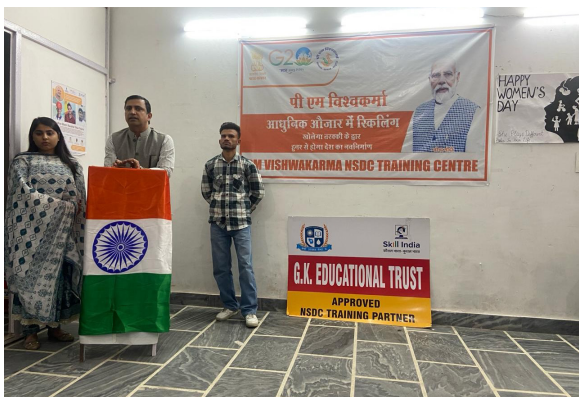
JNEWS SERVICE KATHUA, MAR 8

GK Educational Trust training partner NSDC, ministry of skill development celebrated Women's Day at GKTR PMKK KATHUA. All the students participated enthusiastically in the celebration.