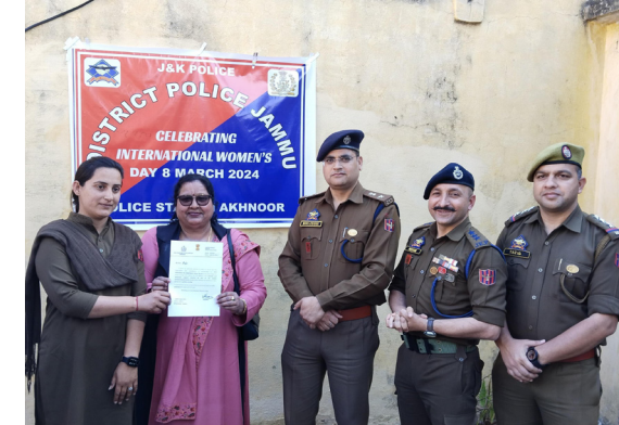
JNEWS SERVICE AKHNOOR, MARCH 8

International Women's Day was celebrated with great enthusiasm at Akhnoor Police Station