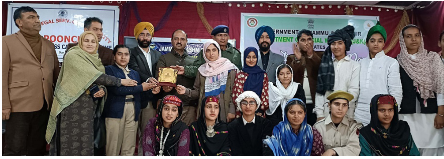
JNEWS SERVICE POONCH, MARCH 8

The Department of Social Welfare with the Collaboration of District Administration, SKC GDC Poonch, DLSA and Police Department celebrated International Women's day here in Multipurpose hall SKC GDC Poonch.