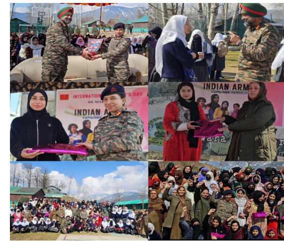
JNEWS SERVICE KUPWARA, MARCH 8

On the occasion of International Women's Day, Indian Army's Kupwara Terriers organised an event where in local woman achievers were able to put forth the story of their journey to success and motivate the girls and woman present.