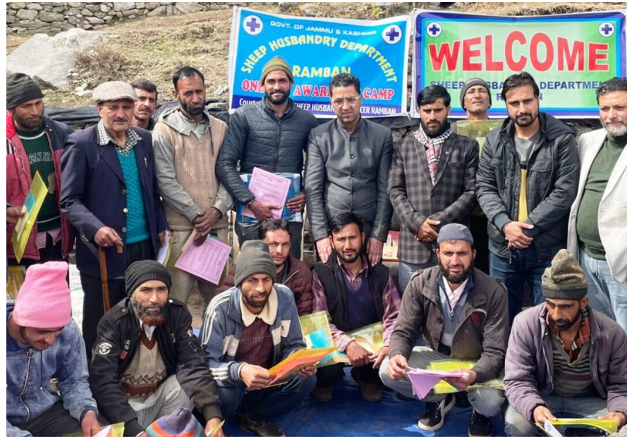
JI NEWS SERVICE RAMBAN, MARCH 7

The Department of Sheep Husbandry Ramban, under the guidance of District Development Commissioner, Baseer-Ul-Haq Chaudhary organized a one-day Capacity Building-cum Training Programme at Rajgarh for farmers, breeders, SHGs and FPO members here today.