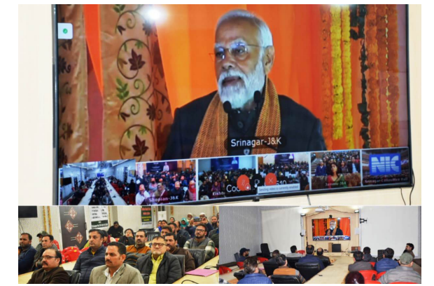
RAJOURI, MARCH 7

The District Administration Rajouri showcased unwavering commitment and enthusiasm as it actively participated in the public rally of Prime Minister Narendra Modi at Bakshi Stadium Srinagar.