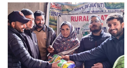
JI NEWS SERVICE RAMBAN, MARCH 7