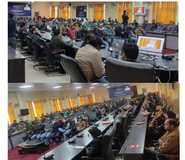
JI NEWS SERVICE RAMBAN, MARCH 7

The people of Ramban district joined in virtual attendance the Prime Minister Narendra Modi's programme at Bakshi Stadium Srinagar. The people of the District Ramban expressed gratitude to the PM for his tireless efforts for promoting holistic development of the UT. Under the diligent coordination of the District Administration, led by Deputy Commissioner, Baseer-Ul-Haq Chaudhary, the live streaming of the Prime Minister's visit to