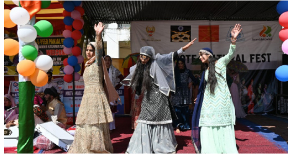
J1 NEWS SERVICE MANJAKOTE, FEB 29