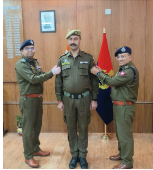
J1 NEWS SERVICE JAMMU, FEB 29