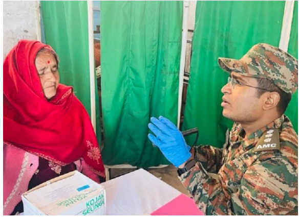
J1 NEWS SERVICE KISHTWAR, FEB 29

As a goodwill gesture and in continuance of its commitment to work for welfare of general public, the Indian Army organised a Medical & Veterinary Camp for residents and livestock at Bugrana village. The aim of this camp is to deliver basic medical services at the door steps of the medically less privileged clientele residing in remote and far flung villages & provide veterinary support for animals and medical facilities for migrating gujjars, thereby providing them the required basic medical facilities for themselves and their livestock. During the camp, Veterinary doctors and a team of doctors from the Army and Civil Compris-