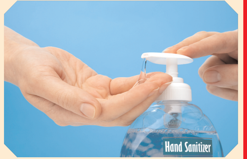
By 2050, about 10 million human lives can be at risk every year if we do not manage the increasing drug resistance, say experts

New Delhi, Oct 10: Increased usage of antibiotics during Covid-19 can lead to more antimicrobial resistance, health experts of the All India Institute of Medical Sciences said, adding that the widespread use of hand-sanitisers and antimicrobial soaps can further worsen the situation.