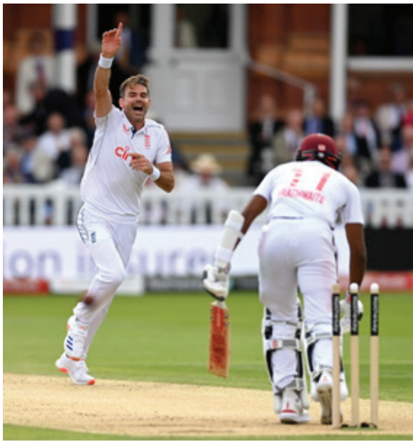
Anderson if he held onto a return catch from Guda-

Debutant pacer Gus Atkinson ended his game with wonderful match figures of 12-106 as England took a 1-0 lead in the