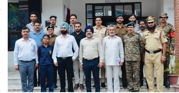
table various challenges they face while shuffling the role of a faculty member in the institute and an ANO. The Group Commander assured them that many such issues of their postings to non-NCC institutes as well as sparing them for the PRCN courses have already been projected by the DG NCC and the ADG to the Hon'ble Lt Governor as well as Principle Secretary Higher/School education and are under favourable consideration.

This conclave also presented an opportunity to the ANOs to bring on the