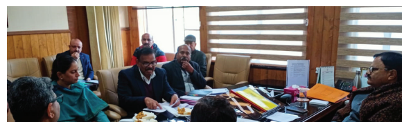
JI NEWS SERVICE JAMMU, DECEMBER 19