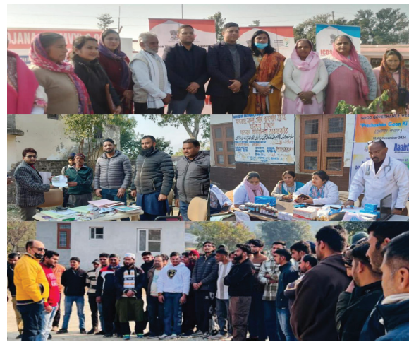
JI NEWS SERVICE REASI, DECEMBER 19

In a significant initiative to promote transparency and citizen-centric administration, the District Administration Reasi has launched special camps and awareness drives across all tehsils to commemorate Good Governance Week 2024. The stakeholder departments, including Revenue, Agriculture, Animal Husbandry, and others, are actively participating in this week-long program.