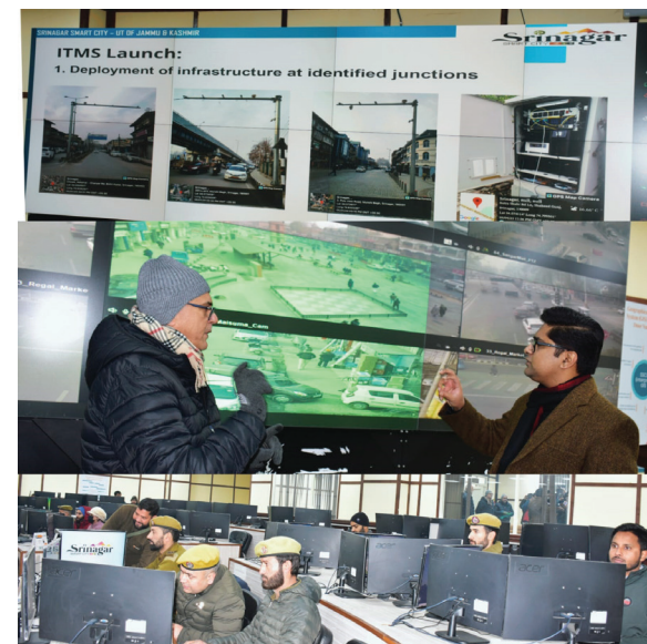
JI NEWS SERVICE SRINAGAR, DECEMBER 19

In a significant step towards modernizing urban management, Srinagar Smart City Limited (SSCL) launched the Intelligent Traffic Management System (ITMS) through its Integrated Command & Control Centre (ICCC) located at HMT Zainakote.