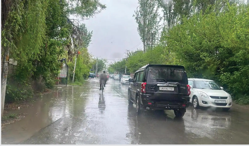
collapsed due to heavy rains in Bujthala, Tehsil Boniyar, Uri. Two persons injured in the incident are

Deputy Commissioner Baramulla Minga Sherpa wrote on X: "Team of Dist Admin B'la @BaramullaPolice & Lachhipura Battalion of @ChinarcopsIA along with locals rescued 7 persons trapped under debris after their house