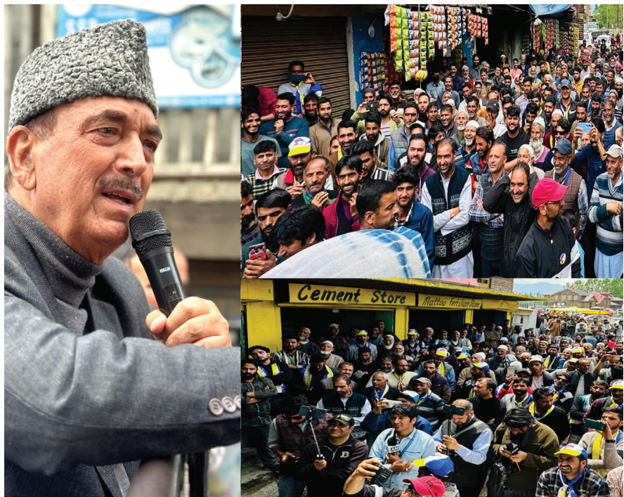
JNEWS SERVICE SRINAGAR APRIL 24

Chairman DPAP, Ghulam Nabi Azad, unequivocally stated that the party will not form alliances with any other party in the Lok Sabha elections. Instead, the DPAP will contest independently. Azad emphasized the party's commitment to fielding young, fresh candidates who embody honesty and possess the potential to effectively represent their constituents in Parliament, echoing his own legacy of raising voices for the people. He said, "I am Azad, I stand independent. My departure from the Congress was a result of leadership failure. Any praise from the Prime Minister in Parliament reflects solely on my work and honesty, devoid of affiliations. Our slate of Lok Sabha candidates predominantly comprises young, untainted faces. My vision is to empower the youth, who possess the fervor to champion public causes. I am confident they will echo the public's concerns in Parliament, much as I have." Azad stressed the impor-