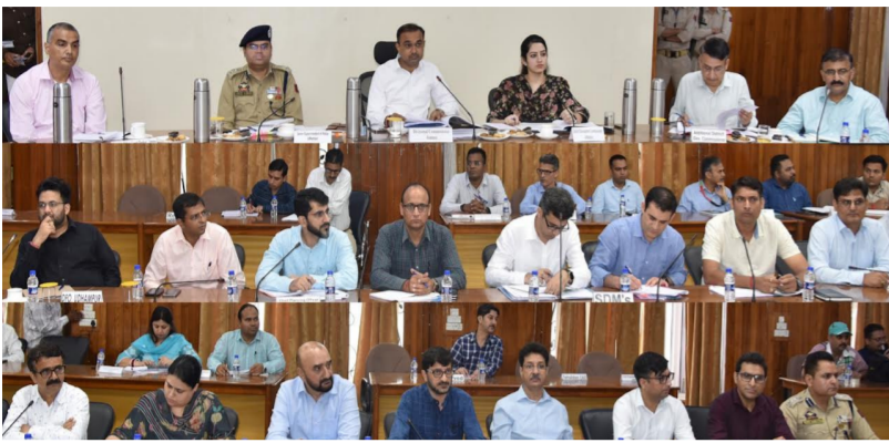
JJ NEWS SERVICE

Urges for rationalization of staff in schools, power supply reliability