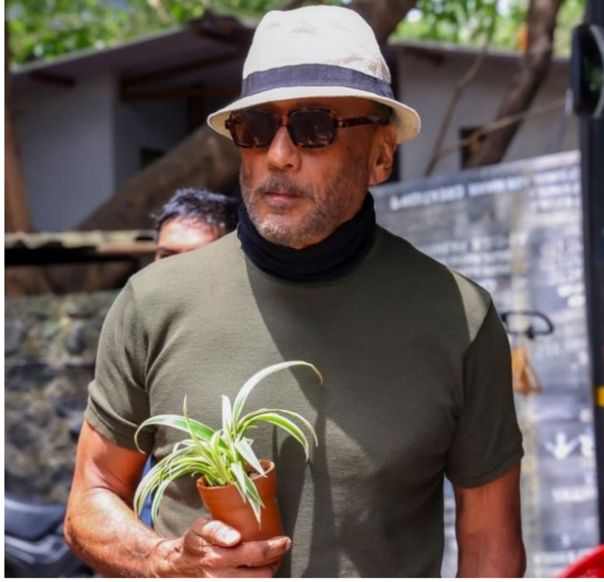
inspiring stories of how people and communities across the country are indulging in innovation and ingenuity

Jackie Shroff will be highlighting the stories of young Indians who are rewriting the narrative of climate change. The campaign has brought together international and Indian filmmakers. These filmmakers will show