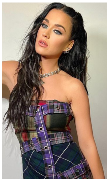
charge during their tours.

However, he struggled with her taking on a more dominant role, particularly when she was in