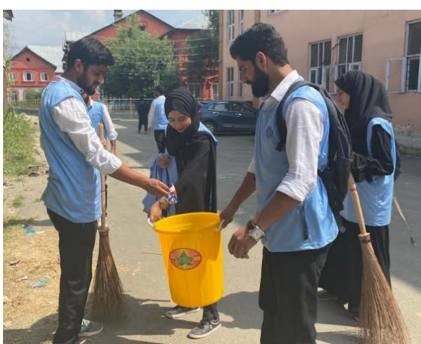
upon the Gandhian ideology of non-violence,

During the opening ceremony, the Principal of the College deliberated