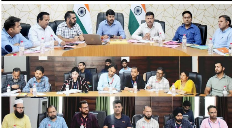
J I NEWS SERVICE

Emphasises for special drive to increase Agriculture credit