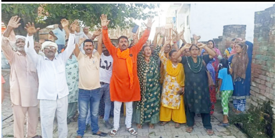
JI NEWS SERVICE

Youth Wing of Shiv Sena Hindustan protest against Pakistan