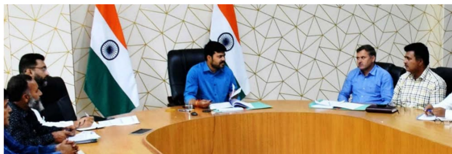
J I NEWS SERVICE