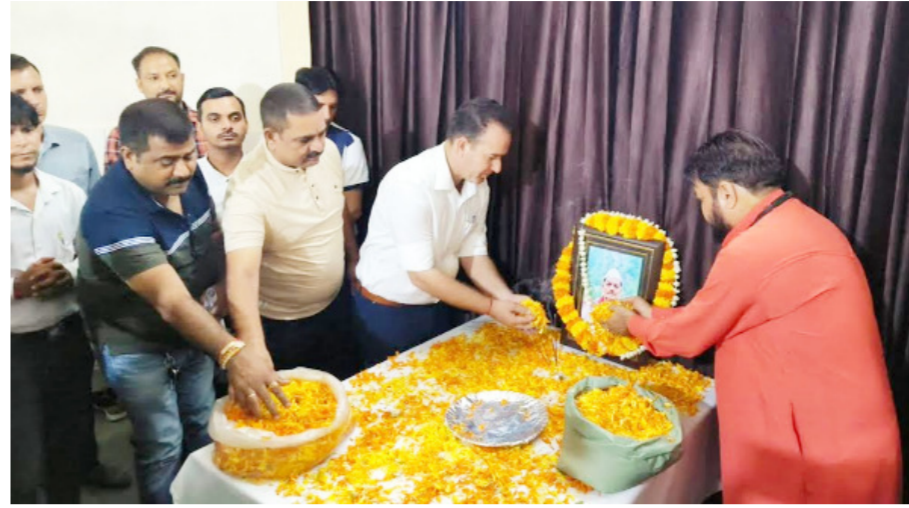
JI NEWS SERVICE