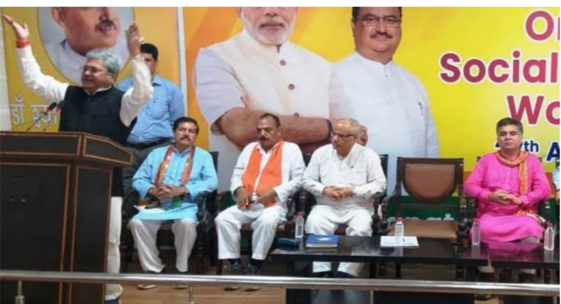
JI NEWS SERVICE