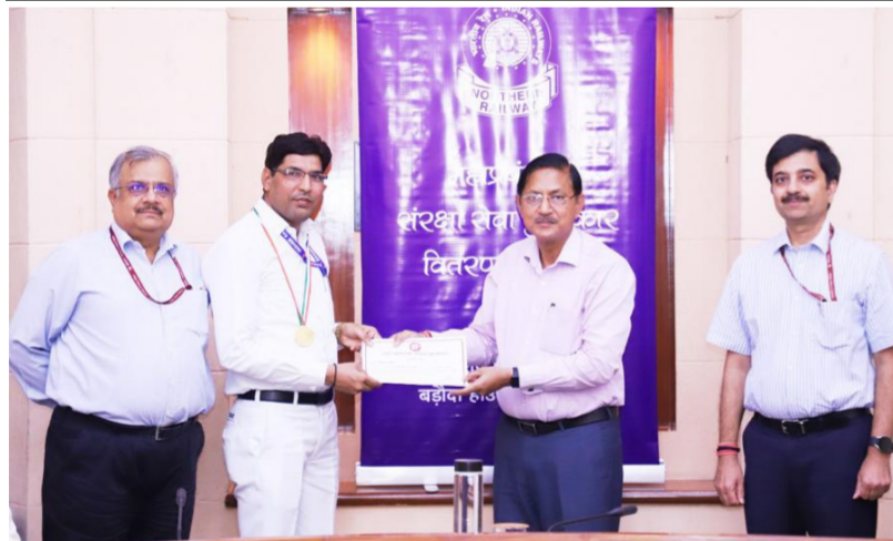
JI NEWS SERVICE

Presented Safety Awards for outstanding achievement for Improving safety Reviews of Safety and infrastructure work | Emphasis on improvement in Punctuality