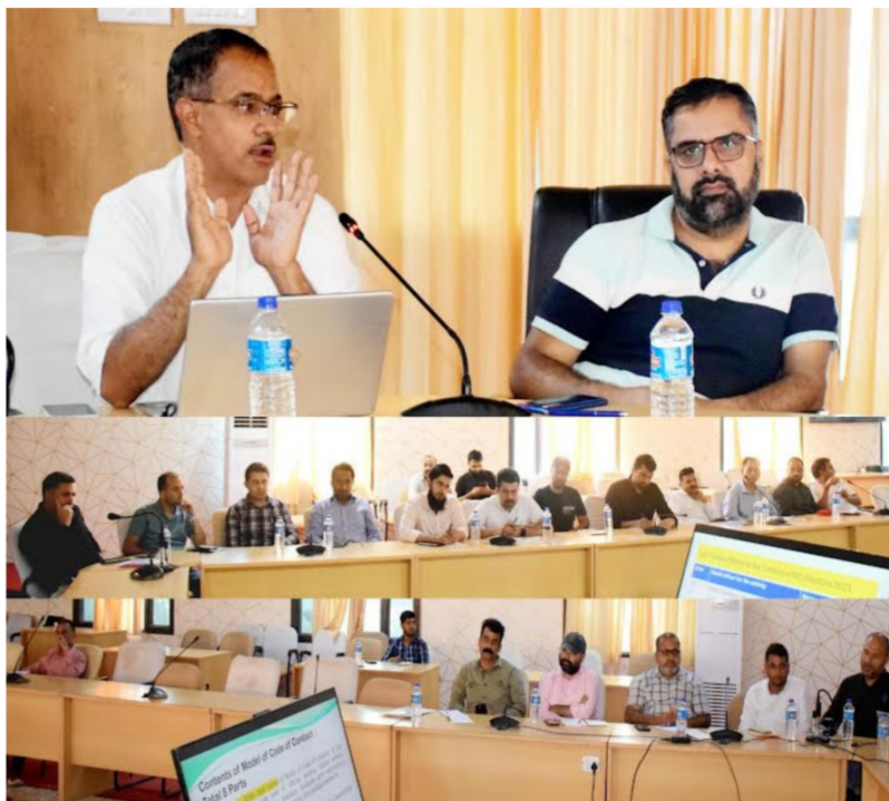
JI NEWS SERVICE