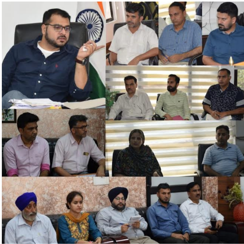
JI NEWS SERVICE