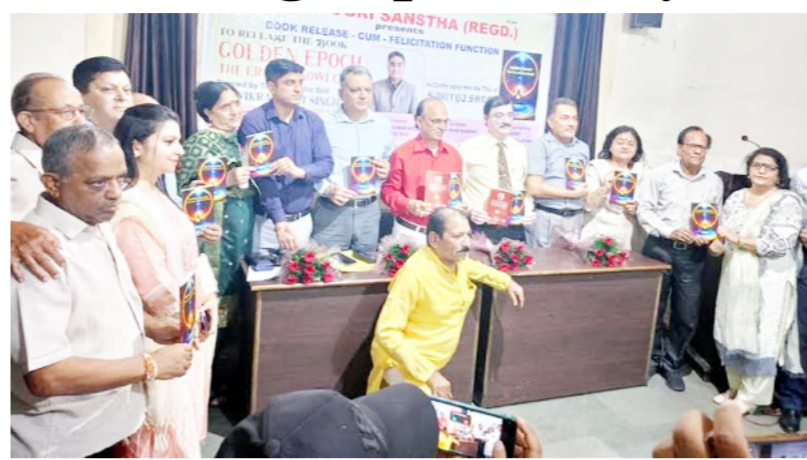
J I NEWS SERVICE