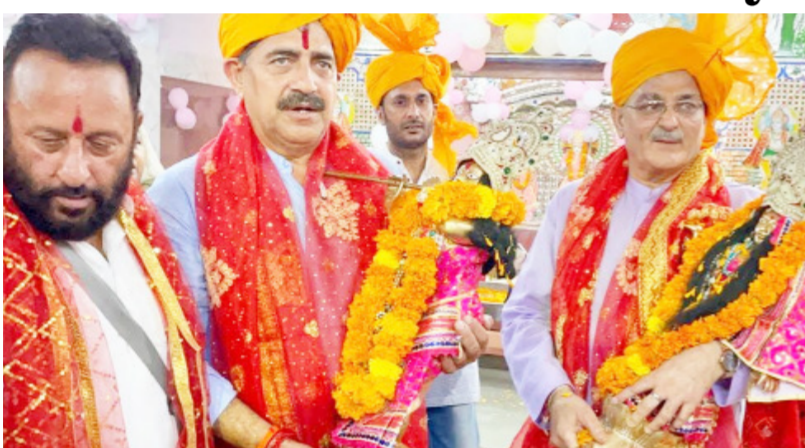
JI NEWS SERVICE