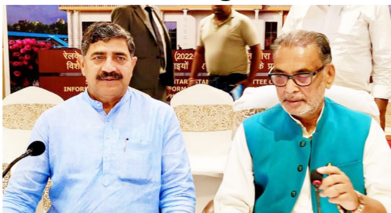
JI NEWS SERVICE