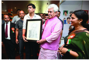
JNEWS SERVICE JAMMU, SEPT 5

Lieutenant Governor Manoj Sinha led the celebration of Teachers' Day in the UT of J&K. After Srinagar, the Lt Governor joined the celebration at Jammu and felicitated the outstanding teachers for their admirable initiatives in school education.