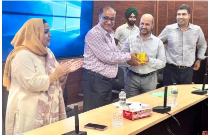
J I NEWS SERVICE

Srinagar, September 05: To commemorate 'Teachers Day' and an unwavering commitment to the ongoing 'Bhrashchhar Mukh - J&K' campaign, the Jammu and Kashmir Entrepreneurship Development Institute (JKEDI) today felicitated its faculty members, here. As part of this special occasion, JKEDI also dedicated itself to a solemn pledge, vowing to champion transparency and accountability in