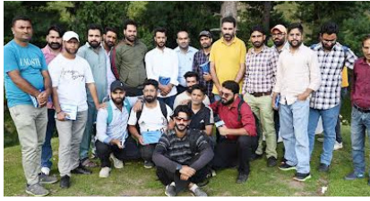
J I NEWS SERVICE

Tour aimed to promote the picturesque tourism spots of the district