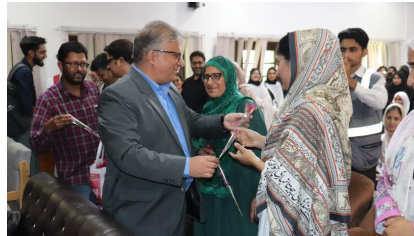
J I NEWS SERVICE

SRINAGAR, SEPTEMBER 05: Amar Singh College Srinagar today observed Teachers' Day to mark the 155th birth anniversary of Dr. Sarvepalli Radhakrishnan, a renowned scholar, recipient of Bharat Ratna, first Vice-President, and second President of independent India. Dr. Radhakrishnan has written extensively on Indian philosophy, and ethics, more specifically on Advaita Vedanta, Universalism and communal harmony. The event began with a warm wel-