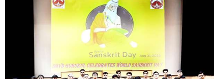
Sanskrit Day - 2023 SMVD GURUKUL CELEBRATES WORLD SANSKRIT DAY