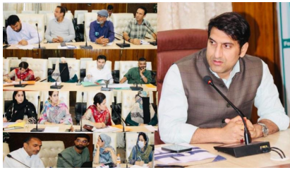
JI NEWS SERVICE

92267 beneficiaries benefited under various social welfare and ICDS schemes