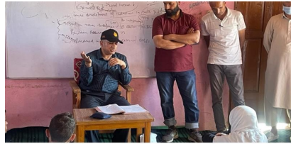
JI NEWS SERVICE