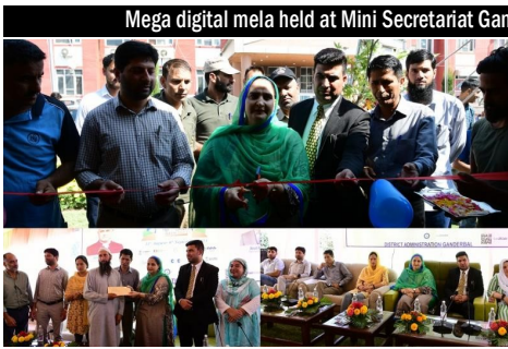
Mega digital mela held at Mini Secretariat Ganderbal