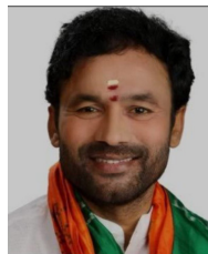
SHRI G. KISHAN REDDY MINISTER OF DEVELOPMENT OF NORTH EASTERN REGION

"This country has been built on such foundation of ancient cultural heritage, where we were told of only one mantra during Vedic period...which we have learnt, we have memorized - "sanghachchhdhvamsavadhvamsam wo manansi jaanataam" - we walk together, we move together, we think together, we resolve together and together we take this country forward - Shri Narendra Modi"