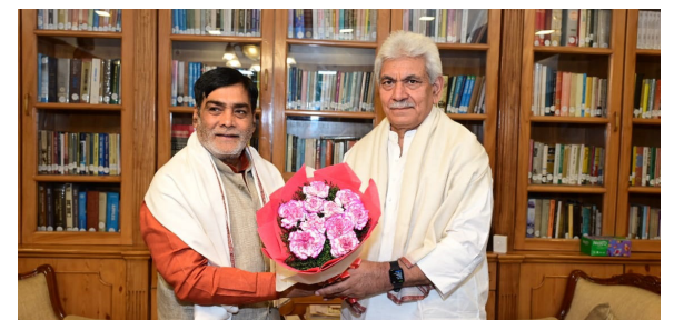
Ram Kripal Yadav, Member of Parliament met Lieutenant Governor Manoj Sinha at Raj Bhawan