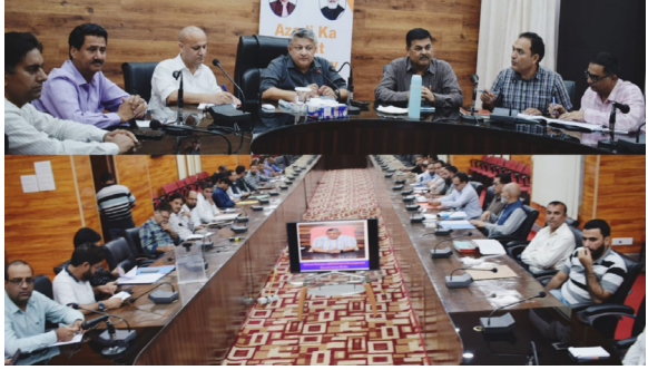
JI NEWS SERVICE DODA, OCTOBER 13

An exhaustive list of deliverables have been assigned to all the departments in the UT to ensure greater efficiency in the overall governance, and has laid down monthly, quarterly, half-yearly and yearly targets for the departments. These developmental contours not only define the quality and quantity of departmental services to be ensured in a time-bound manner, but also envision enhanced efficiency and productivity through greater inter-departmental convergence and coordination.