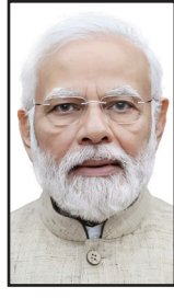
NARENDRA MODI PRIME MINISTER OF INDIA

A few days ago we lost Professor M.S. Swaminathan. Our nation lost a visionary who revolutionised agricultural science, a stalwart whose contribution to India will always be etched in golden letters. Prof. M.S. Swaminathan loved India and wanted our nation, and our farmers in particular, to lead a life of prosperity. Academically brilliant, he could have chosen any career but he was so impacted by the Bengal famine of 1943 that he was clear that if there is one thing he would do, it would be to study agriculture.