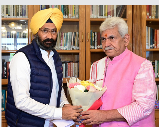
S. Parminder Singh Dhindsa, former Finance and Public Works Minister of Punjab called on Lieutenant Governor Shri Manoj Sinha at Raj Bhavan.