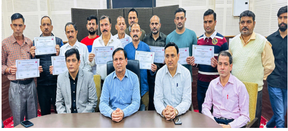
Ji NEWS SERVICE JAMMU, NOVEMBER 4

To augment and strengthen the skills of the employees of Shri Mata Vaishno Devi Shrine Board (SMVDSB) Katra, a six day training Programme on "Basic Computer Skills" was organised at Government Polytechnic College Jammu Oct 30, 2023 to Nov 4, 2023.