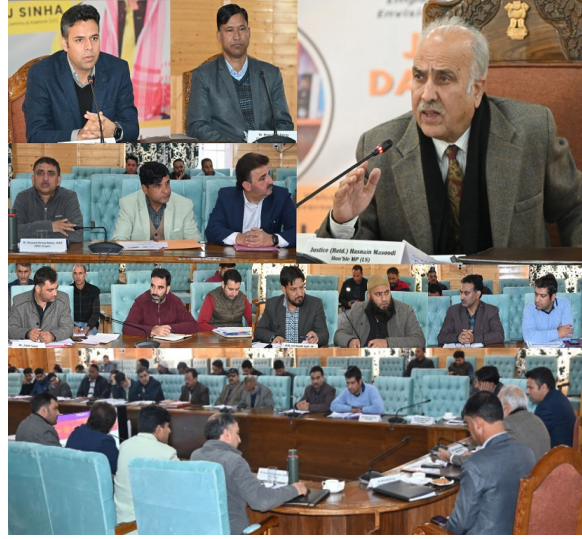
KULGAM, OCTOBER 4