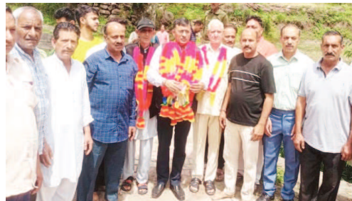
JJ NEWS SERVICE

RAJOURI, MAY 28: The inauguration of the new parliament house is India's assertive step towards shedding its colonial mindset and a resolve to India's global resurgence based on the principles of "swa" or selfhood (swadharna, swadeshi and swaraj). The