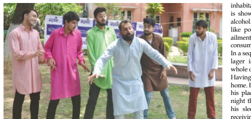
JJ NEWS SERVICE

JAMMU, MAY 28: Balwant Thakur's Hindi play 'AAG' staged here today under Natrang's weekly theatre series 'Sunday Theatre' at Nagrota Park, Jammu under the direction of Neeraj Kant. The play showcases how the Drug-menace is ruining the generations and thus crippling the developing nations. The youth of the country, the most energetic human resource of the country, sometimes unknowingly slip into the world of drug-addicts.